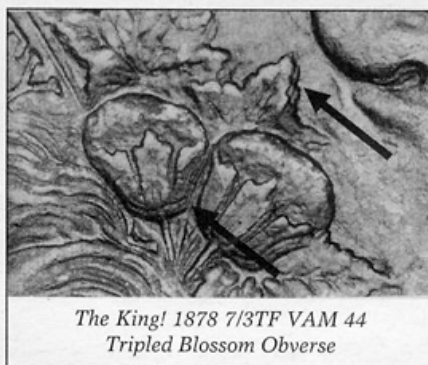
The King! 1878 7/3TF VAM 44 Tripled Blossom Obverse

on some 1878 7TFs, some 1878 CC, and a few 1878 S varieties. It can easily be identified by its long center arrow shaft with the center nock or tip of the shaft extending further out than normal. The VAM Encyclopedia only listed three such varieties in its 1991 edition, but now some 9 different varieties are known. The only way to attribute these varieties is through a Quick Attribution Guide to the 1878 S B 1 Reverses published by RCI as a past issue of Top 100 Insights . There are less than 250 1878 S B 1 reverse specimens known in all grades spread among all nine different varieties, making this class of varieties quite rare and special. There were several newspaper accounts in 1878 that described the striking of these first San Francisco Silver Dollars, and there was mention of dies failing early in their production runs. The average number of coins known per variety is presently a mere 30, with one of the more recently discovered varieties having only a single specimen known in VG. After careful deliberation, we decided to rank this whole class of variety as a Top 10 . Talk about rarity! For all nine varieties, we might mention that there are only three specimens known in the lofty grade of MS.